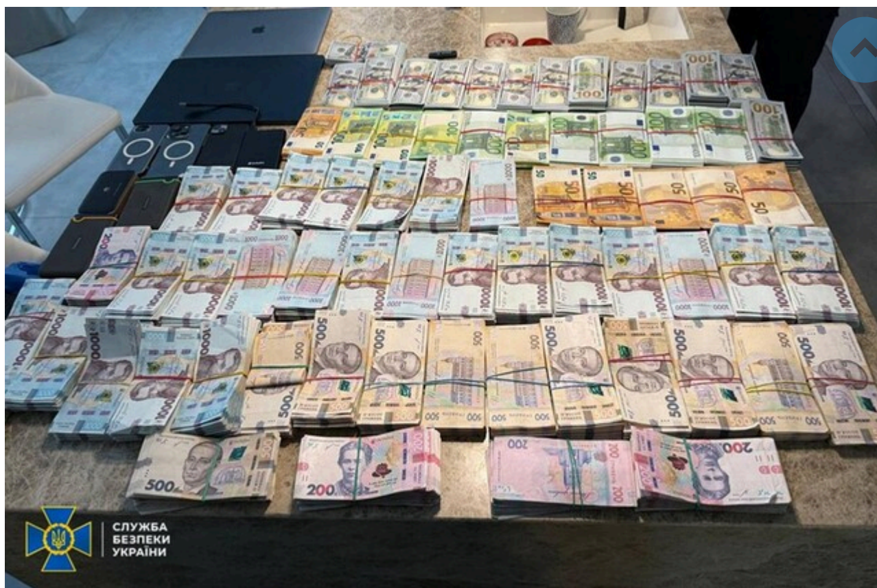
Cash.